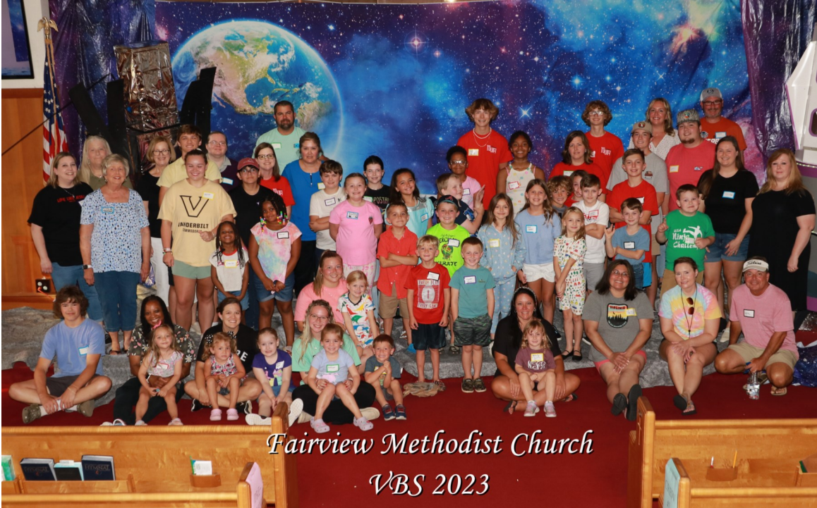
Fairview Methodist Church VBS 2023